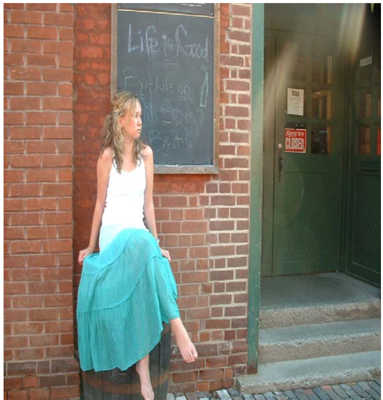
Photographer and Model We explore many facets of the industry