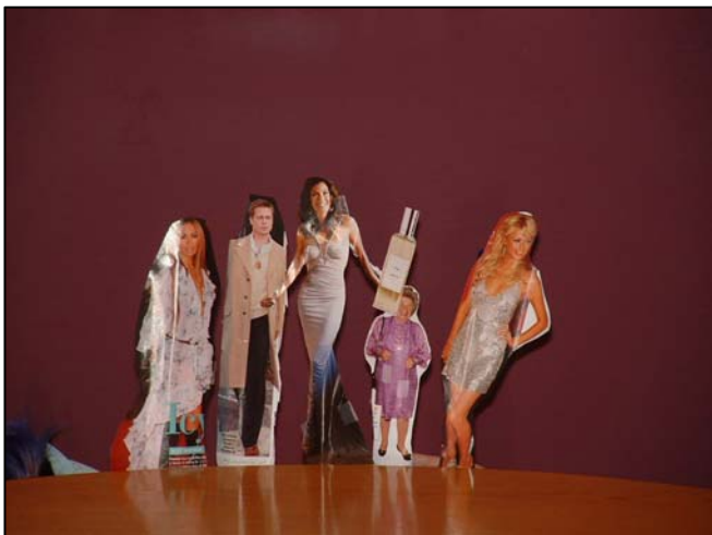
Meet all of your favourite celebrities and analyze their taste and style

Striving to Provide the Best Experiential and Individual Learning Programs in Canada