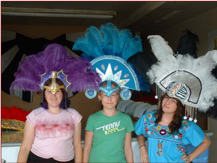
Students enjoy a break from their costume making responsibilities at Caribana.