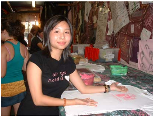
Silk Screening on Trendy Queen Street – Peach Berserk

Working with their teacher, students will produce a final project of their choosing to demonstrate the skills and knowledge acquired during the course.